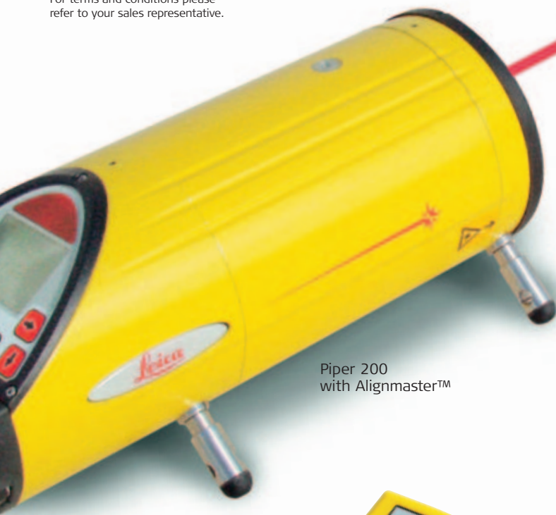
Piper 200 with Alignmaster™

* For terms and conditions please refer to your sales representative.